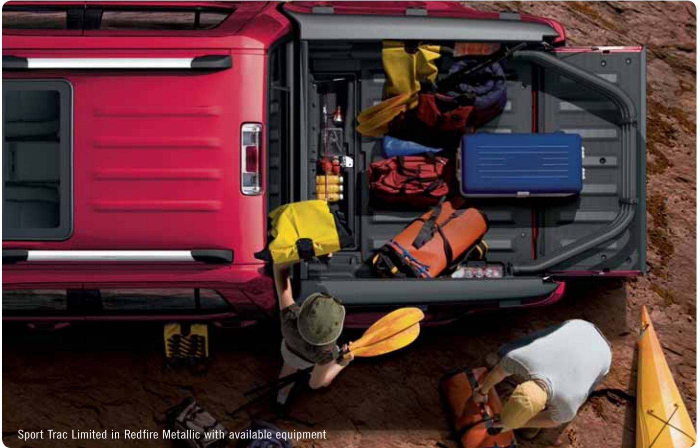
Sport Trac Limited in Redfire Metallic with available equipment