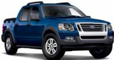
Dark Blue Pearl Metallic