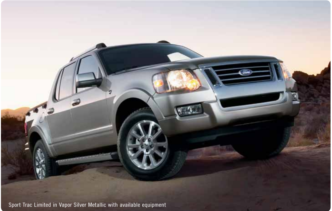
Sport Trac Limited in Vapor Silver Metallic with available equipment