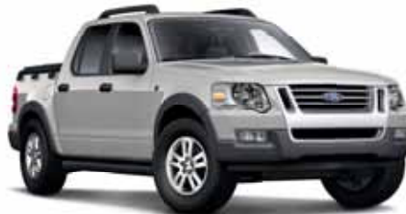
Silver Birch Metallic