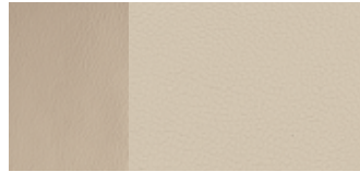
Camel Leather with Sand Inserts Optional on Limited