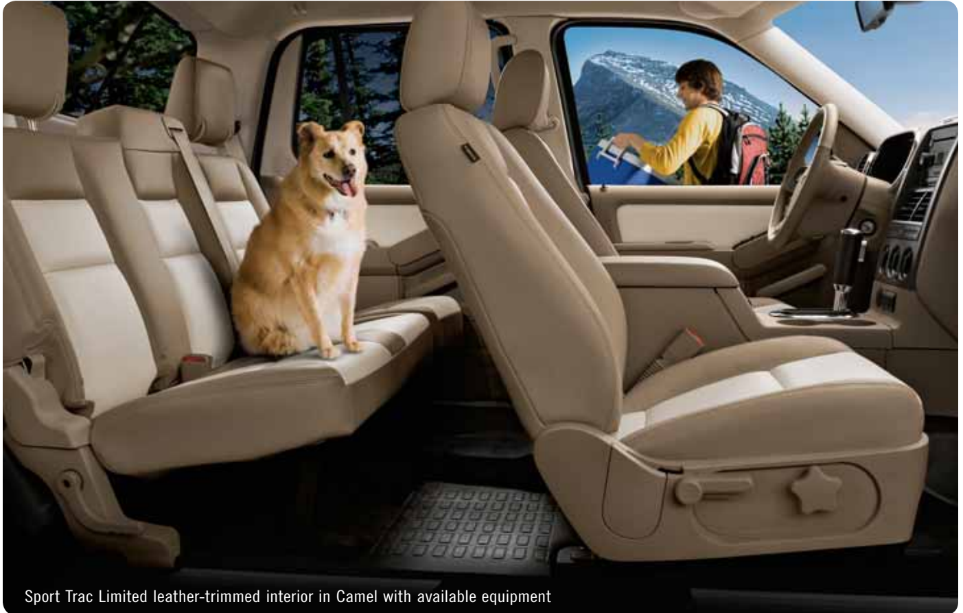
Sport Trac Limited leather-trimmed interior in Camel with available equipment