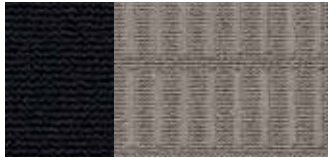
Dark Charcoal Cloth with Light Stone Inserts Standard on Limited