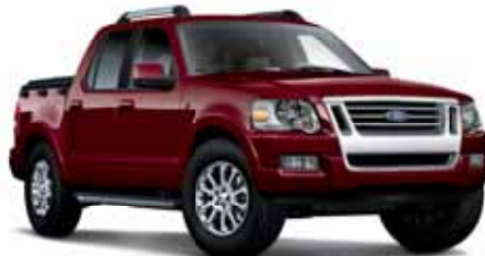
Dark Cherry Metallic

Ford uses clearcoat paint for beauty and protection. Colors shown are representative only. Not all colors are available on all models. See your dealer for actual paint/trim options. Vehicles shown may contain optional equipment.