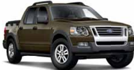
Stone Green Metallic