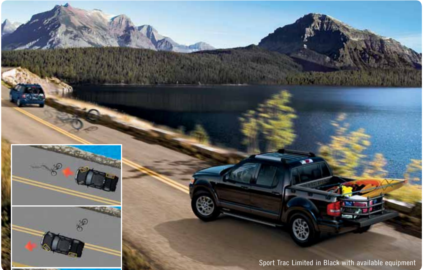
Sport Trac Limited in Black with available equipment