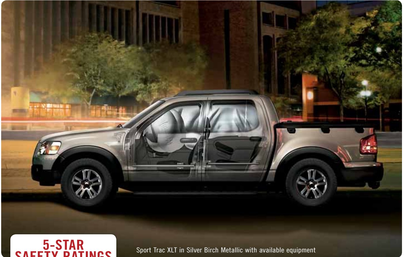
Sport Trac XLT in Silver Birch Metallic with available equipment